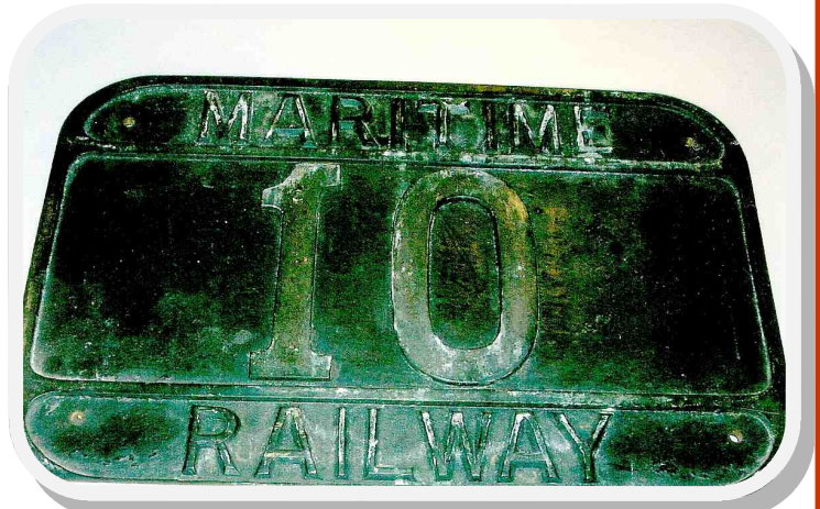
Locomotive #10 as seen in action and it’s number plate now in Joggins Museum

Watch for “A Trip to England” by Bruce Nord in our February issue. Bruce and Ruth visited southern England in 2011 and visited a few of the many Tourist Railways in England